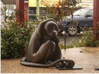
The Brass Monkey of Stanthorpe, Queensland - the place known for its “brass monkey weather”, complete with a set of balls

“Cold enough to freeze the balls off a brass monkey” and “you can't beat a dead horse.”